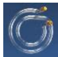
The spiral lamp (for the RC-901 and 902) handles a surface area of up to 140 mm diameter, and is used for curing Blu-ray Disc™, lens coatings, potting, as well as other applications.